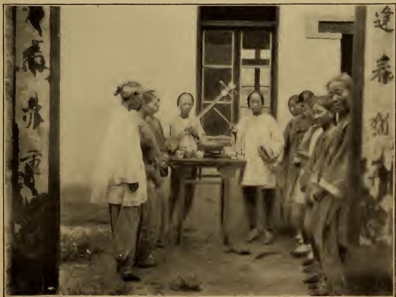
THE VILLAGE STORY-TELLER.